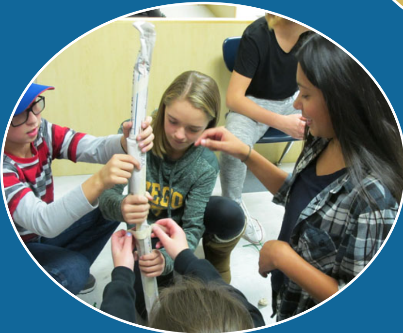
Students at High Desert Middle School participate in a tower building challenge through The Central Oregon STEM (science, technology, engineering and math) Hub