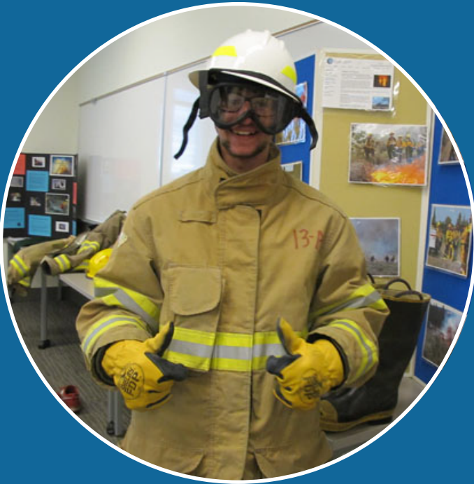
Central Oregon Skilled Trades & Apprenticeship Fair