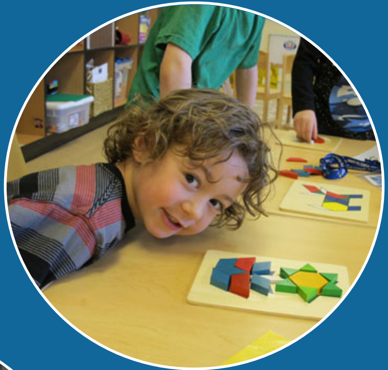
Puzzle Time at the Early Childhood Special Education Program