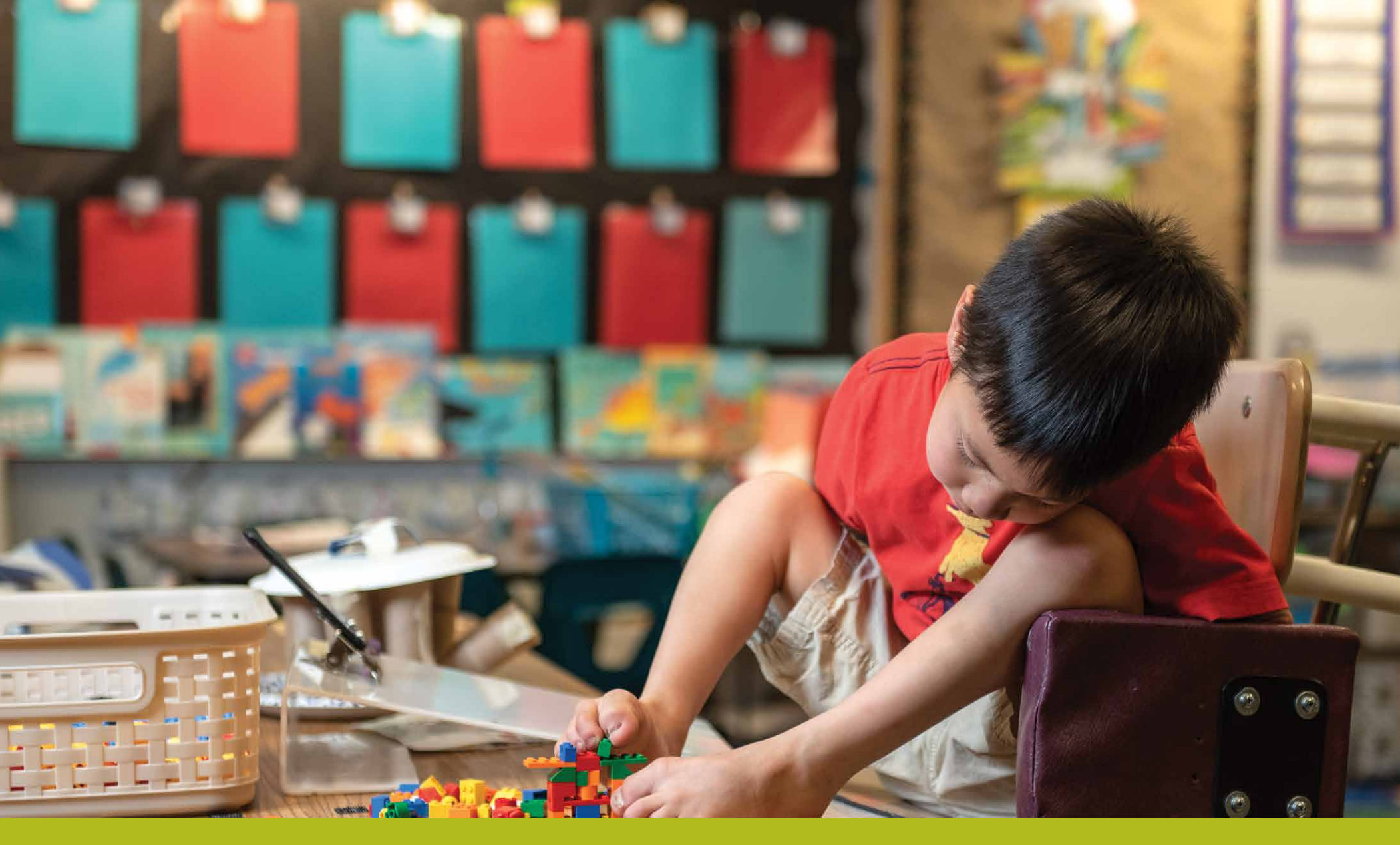
THIS WAY FORWARD >