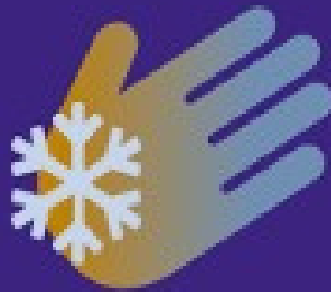
PALE, BLUE OR COLD SKIN