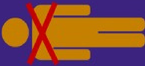
SHALLOW BREATHING OR NO BREATHING