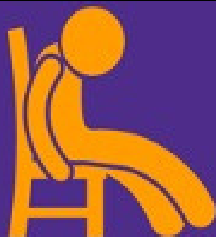
FALLING ASLEEP OR LOSS OF CONSCIOUSNESS