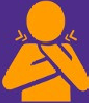
CHOKING OR GURGLING SOUNDS